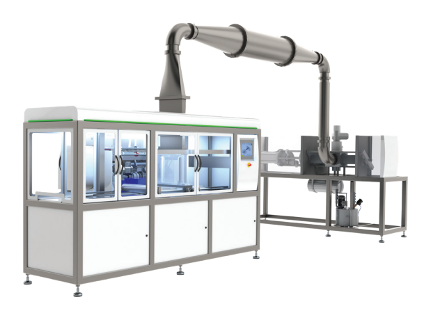
PLATE-packaging machine BPM 3000